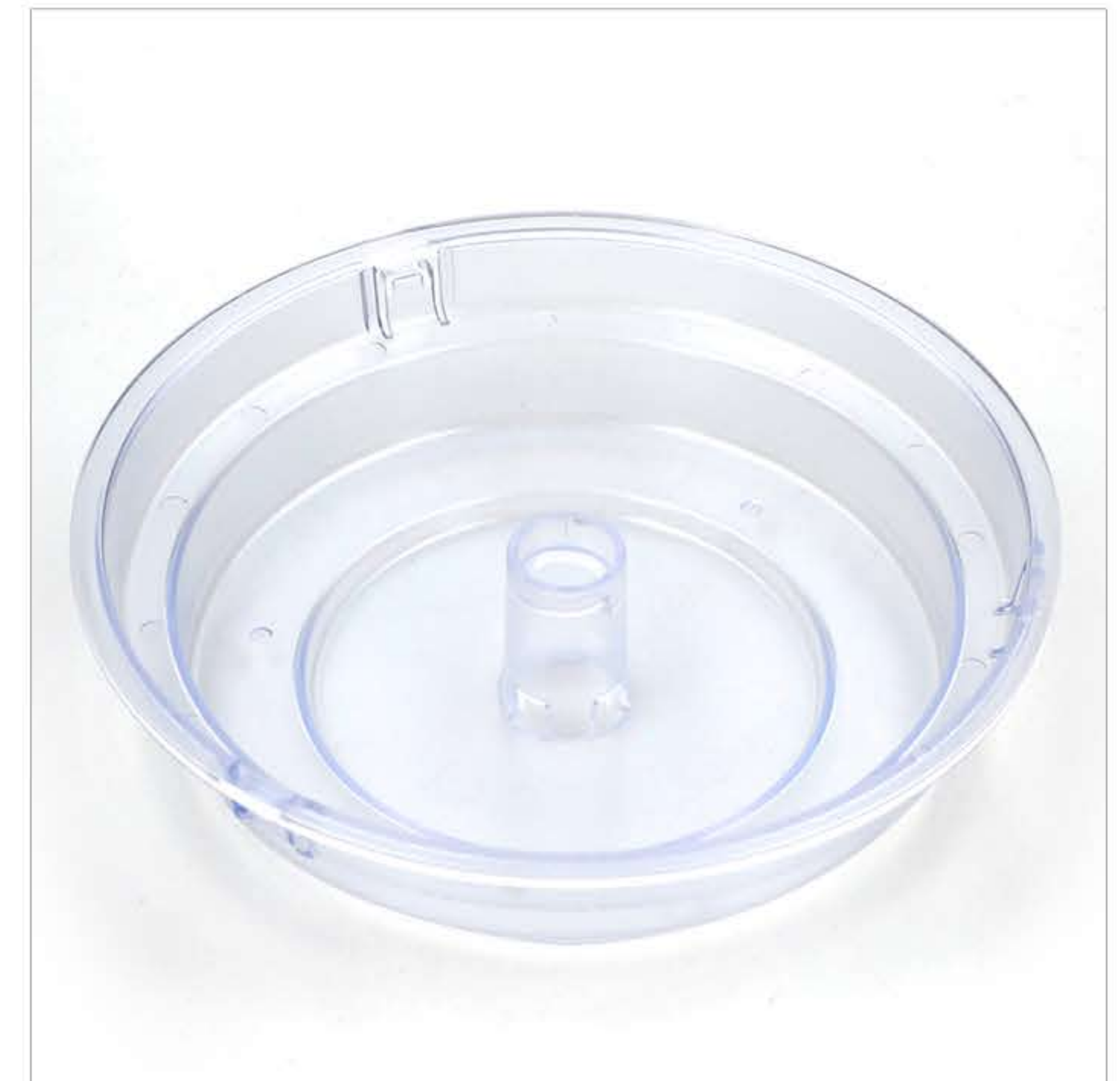
Filter Shield X 1pc