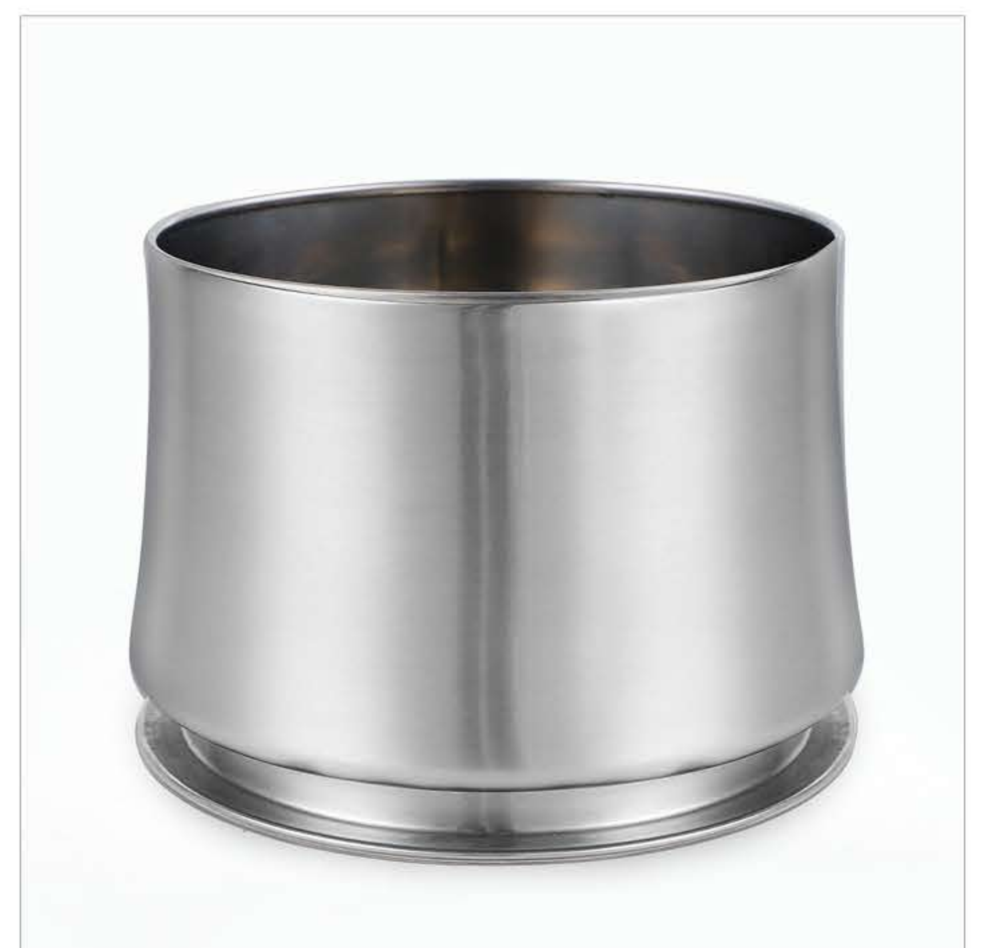
Pet Water Fountains Base X 1pc