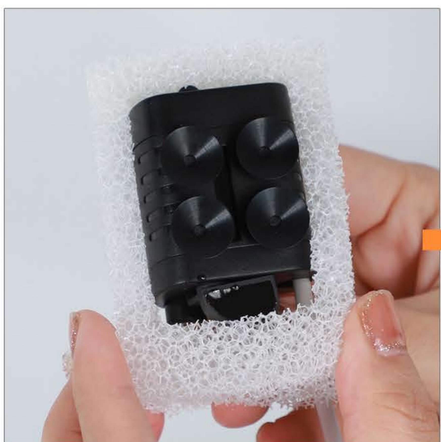
Put on the filter cotton