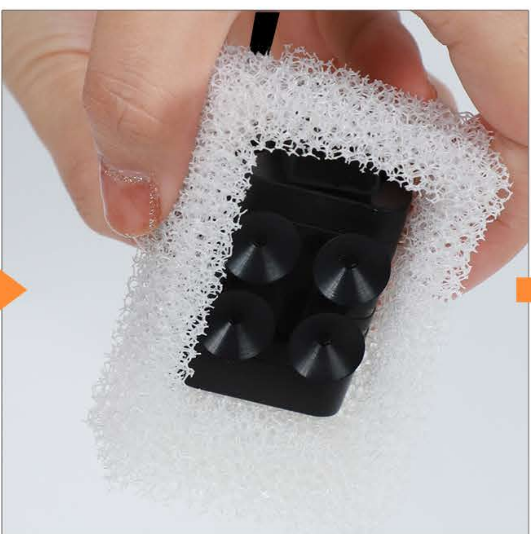
The bottom of the water pump suction cup is facing down