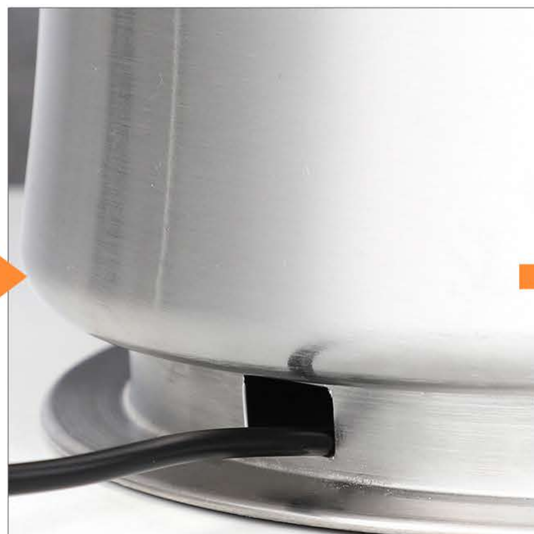
Through the bottom wire hole