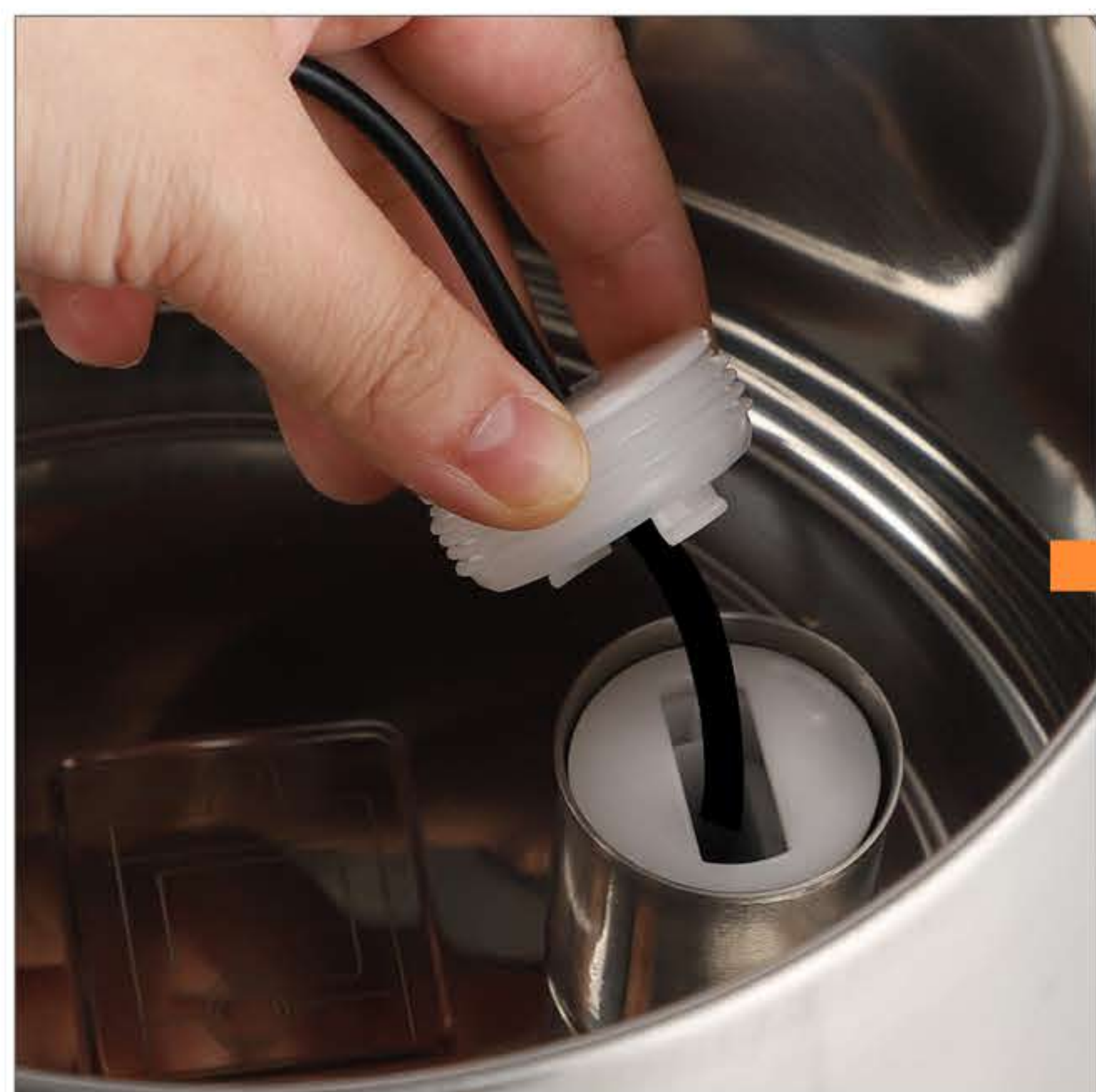
The USB jack goes through the wire mouth