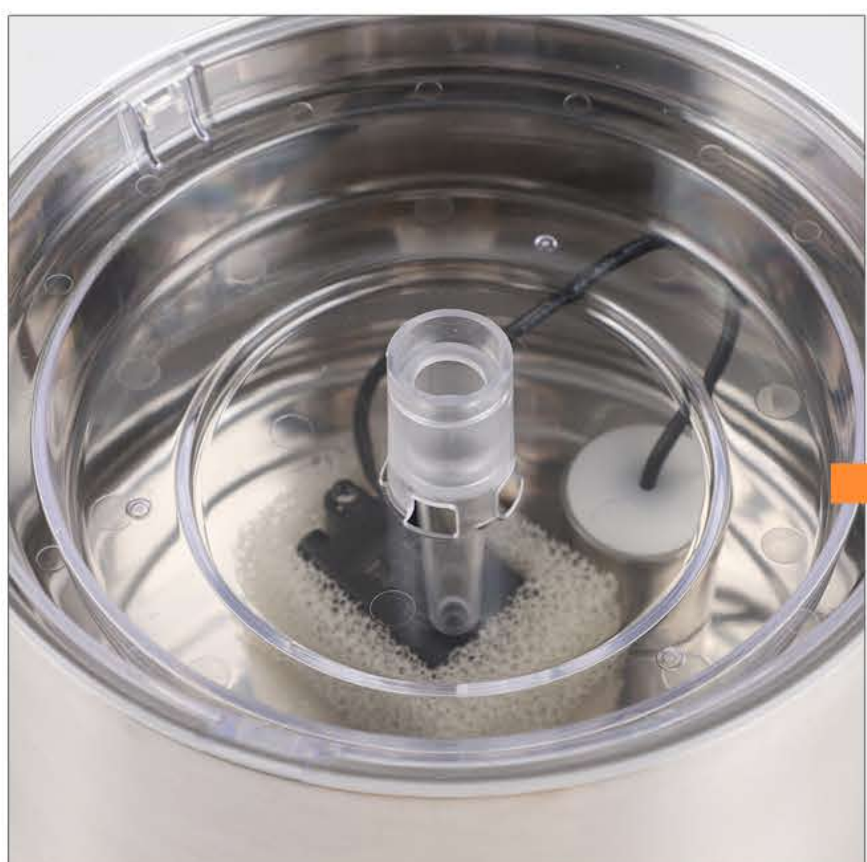
Align the nozzle in the middle of the filter shield