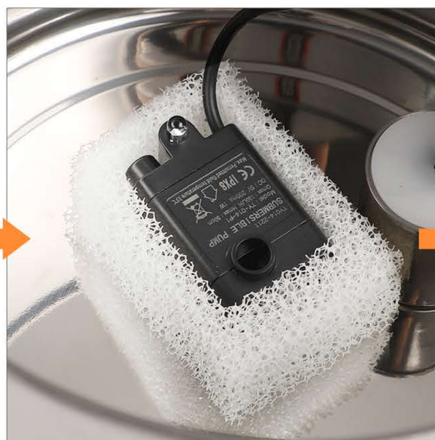
Make sure it is placed in correct direction in the suction cup slot