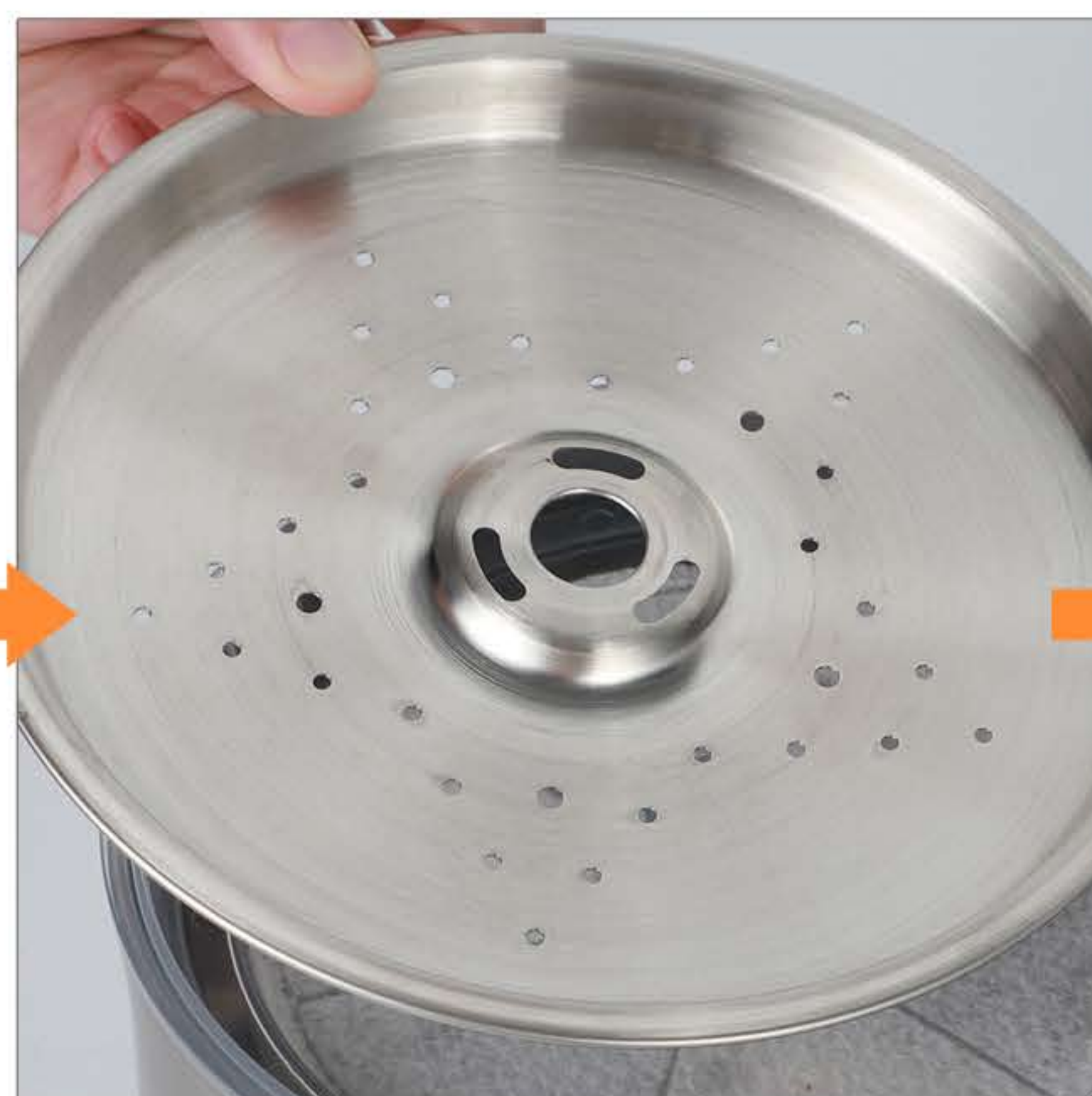
Put on the water tray