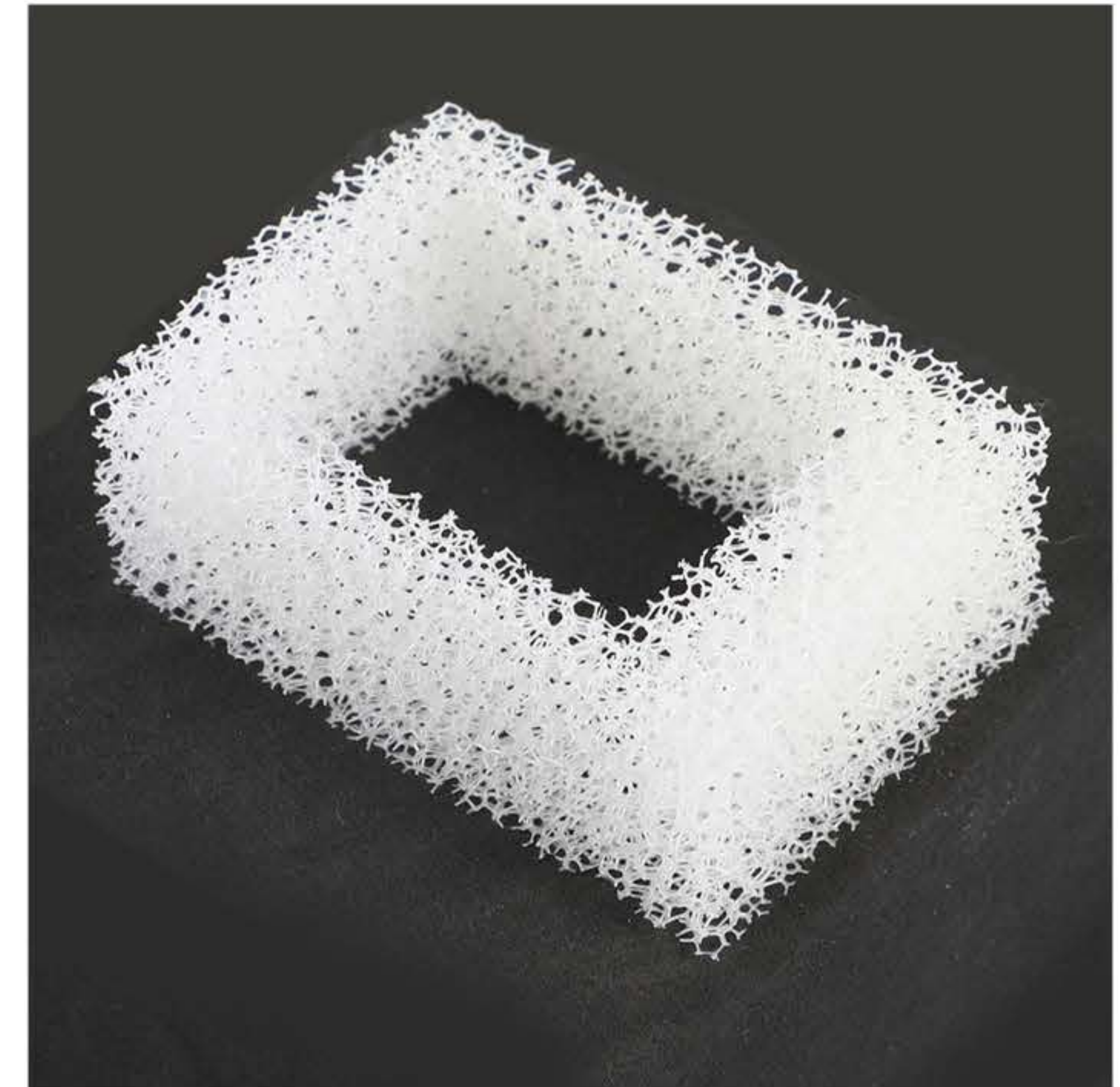
Filter Sponge X 1pc