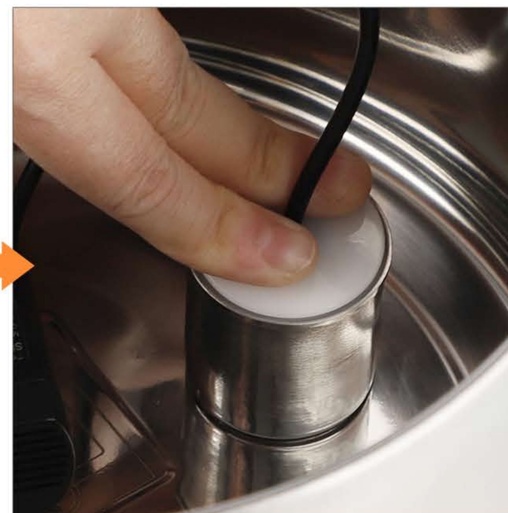
Press to make sure it doesn't shake