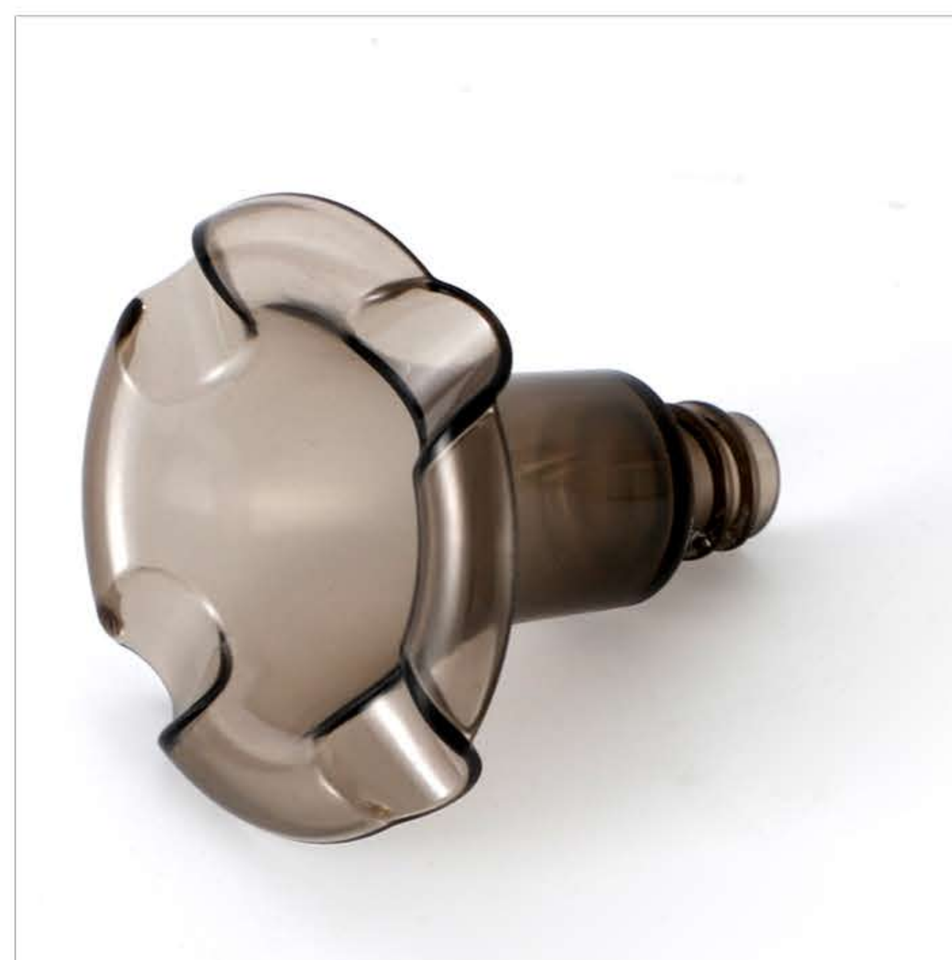
Sprinkler X 1pc