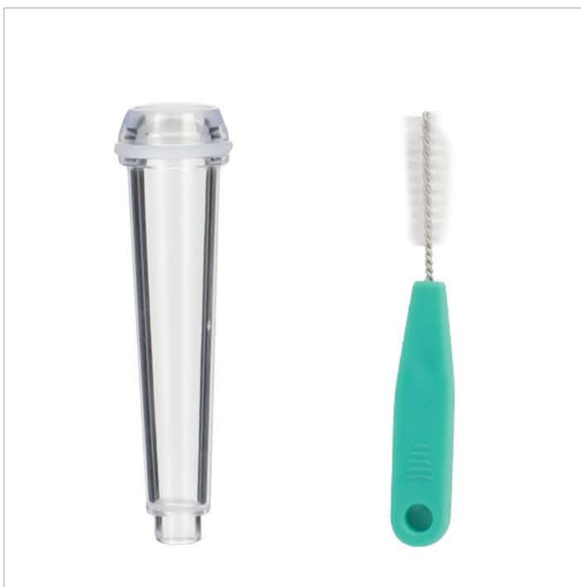
Connecting Pipe X 1pc Cleaning brush X 1pc