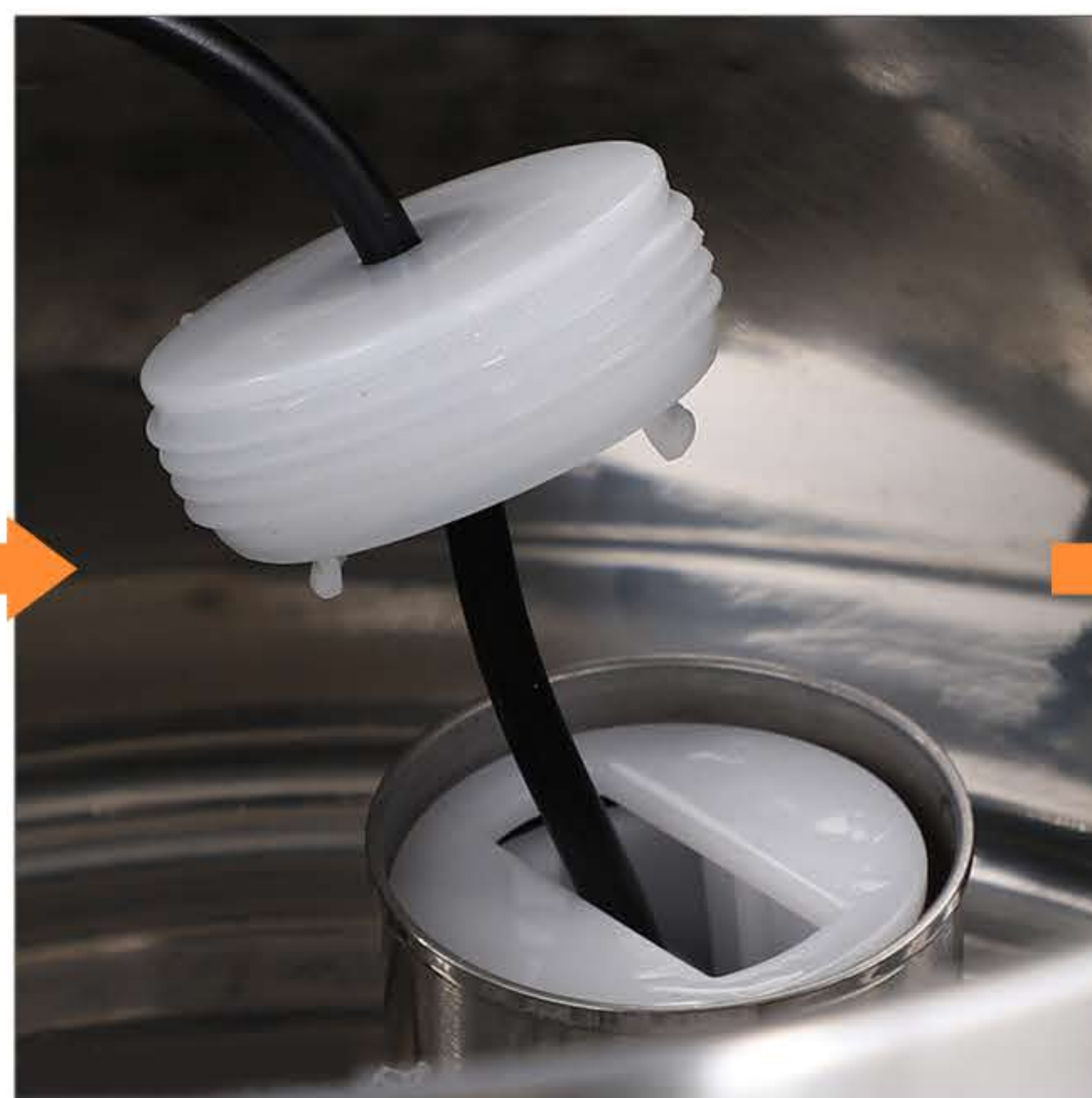
The bouncing soft plug is aligned with the mouth of device