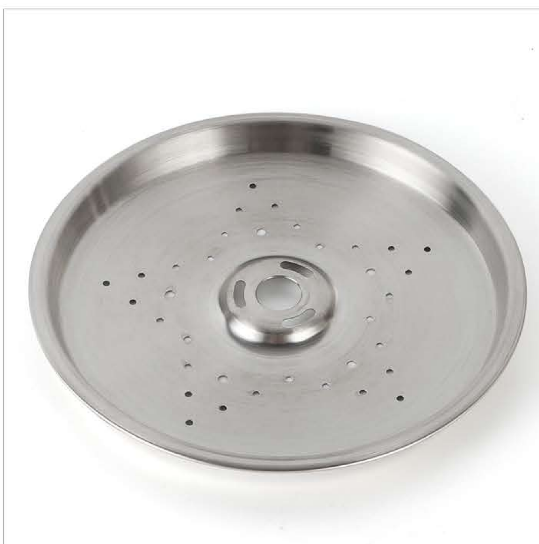
Water Tray X 1pc