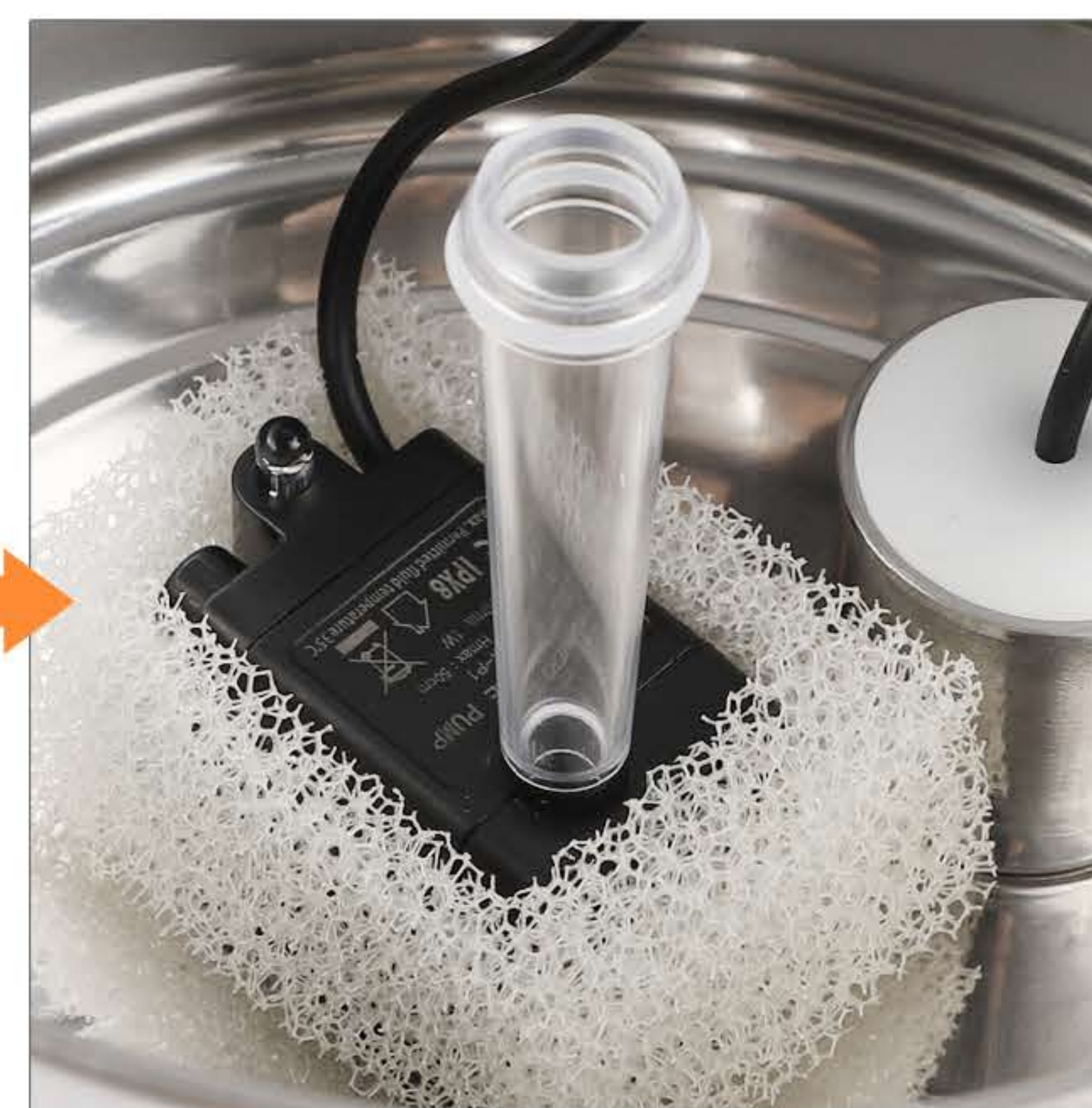
Plug in the connecting tube