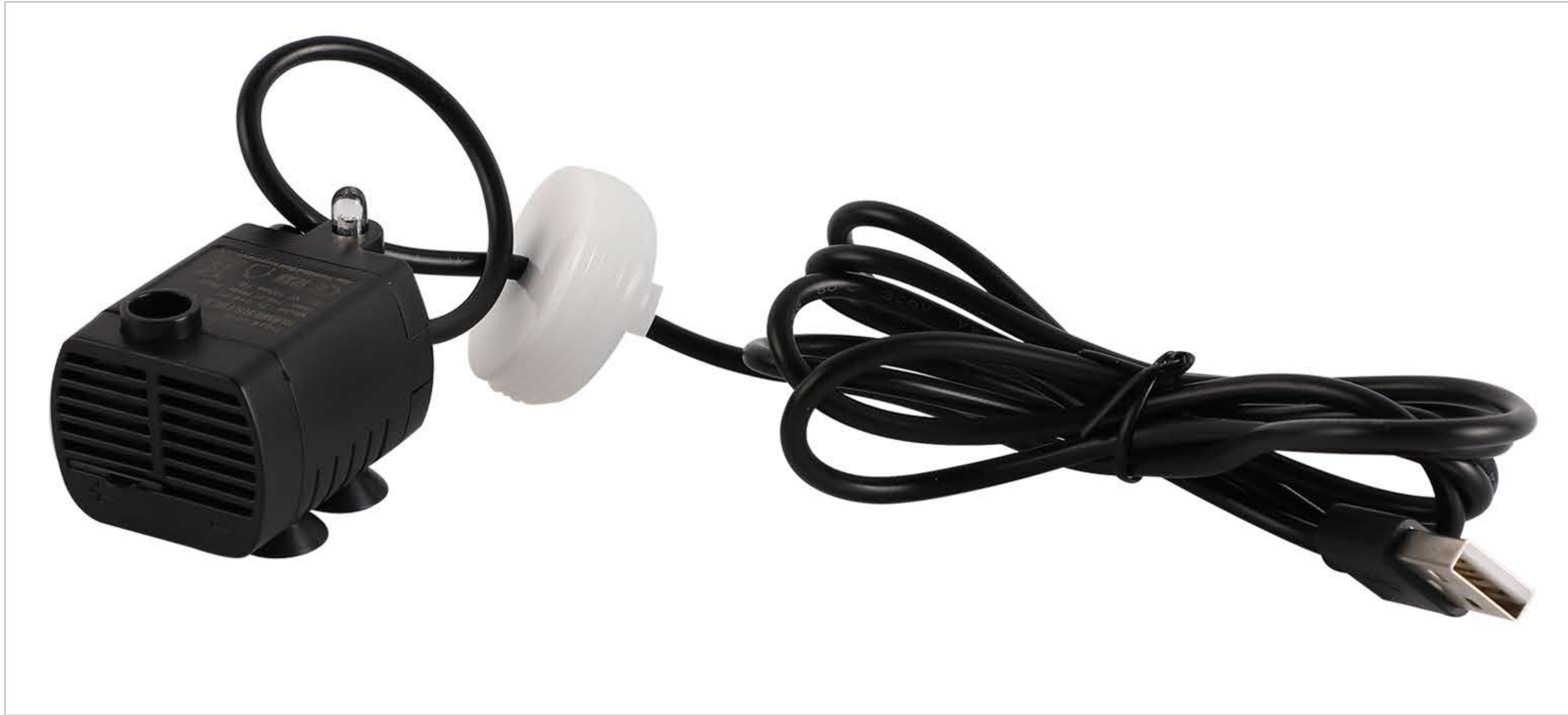
Water Pump & USB cable X 1pc