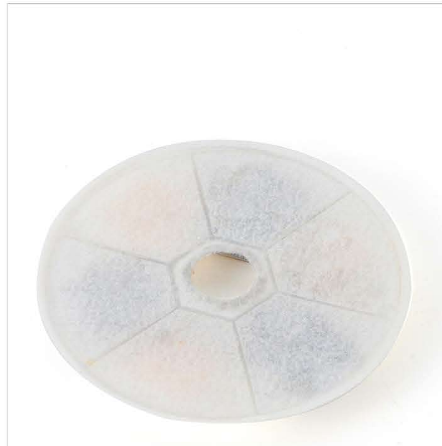
Activated Carbon Filter X 1pc