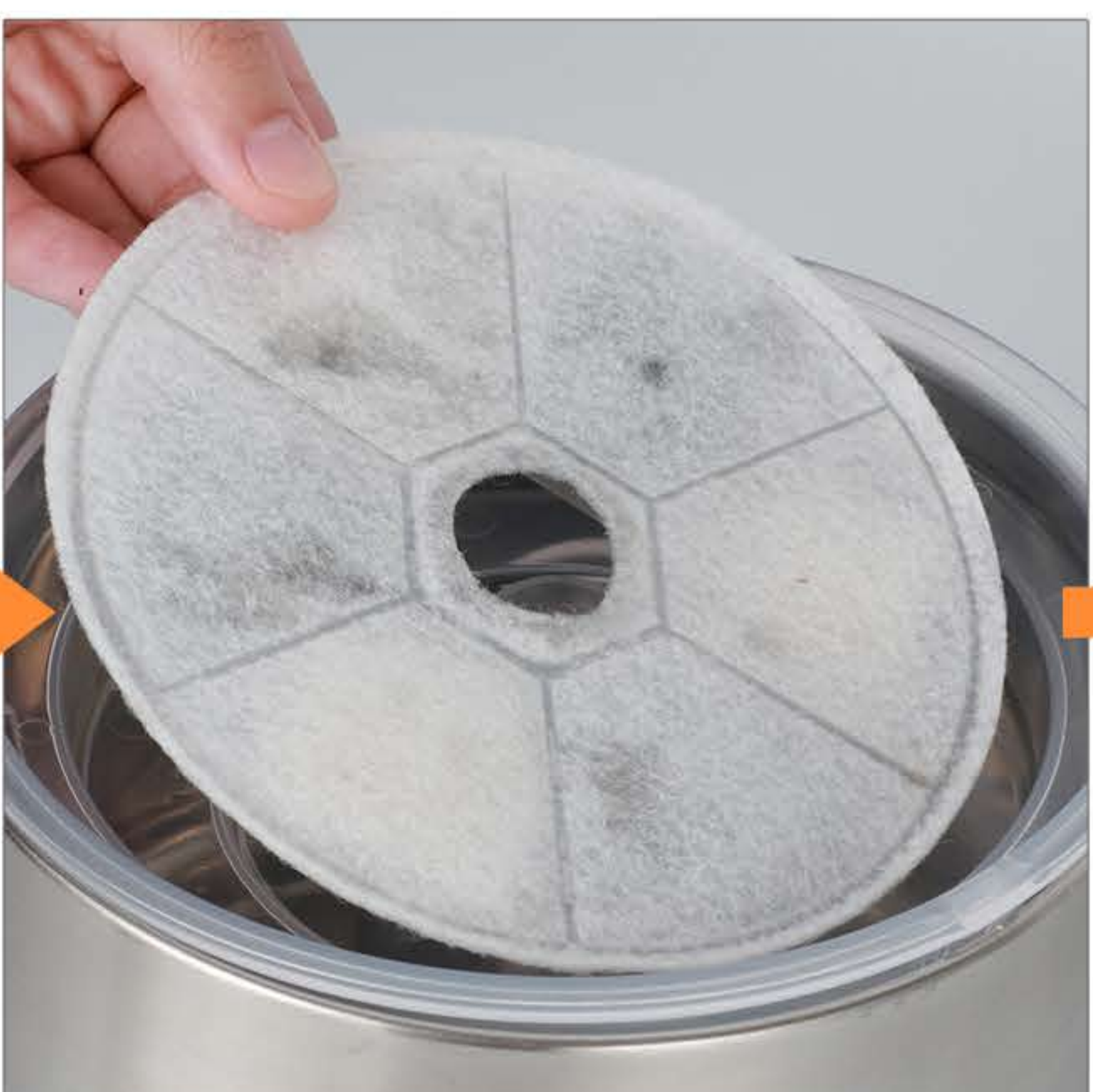
Put activated carbon filter in turn