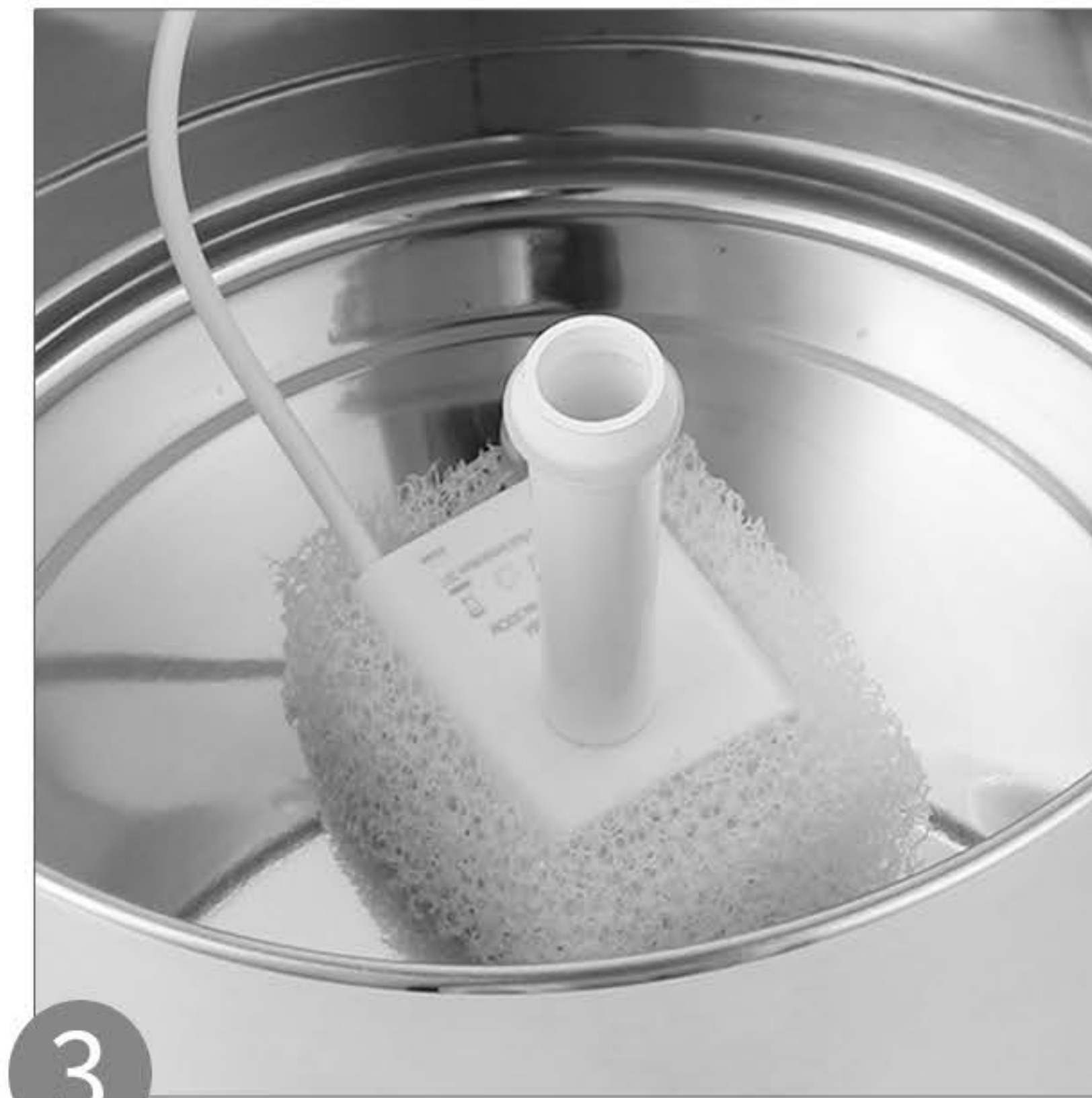
3 Plug in the connecting tube