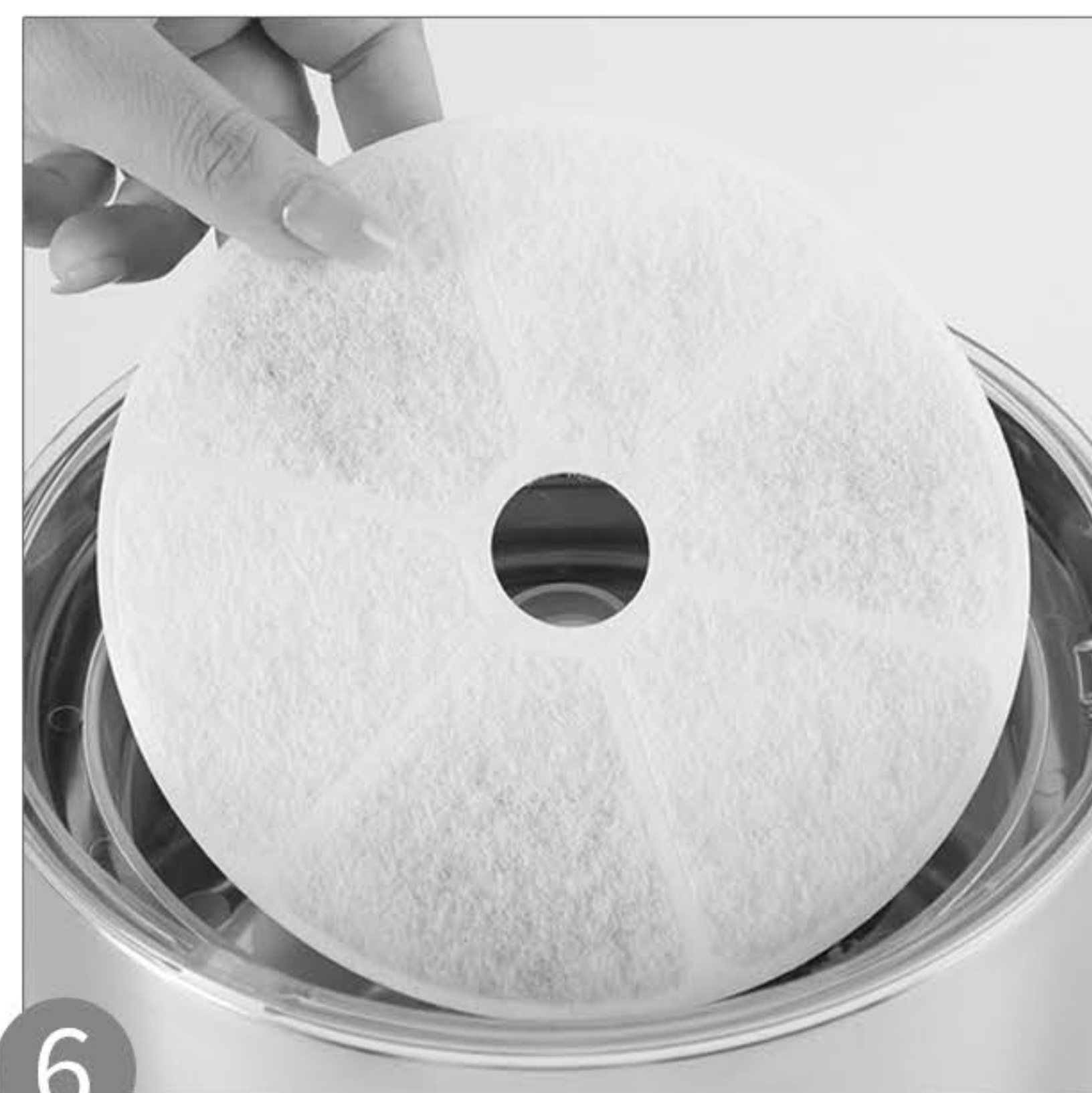
6 Put activated carbon filter in turn