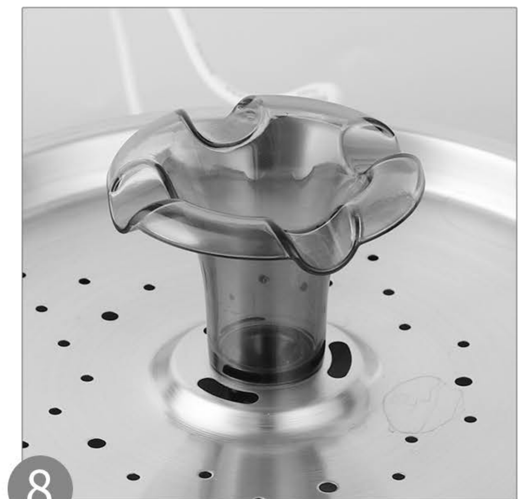
8 Tighten the sprinkler