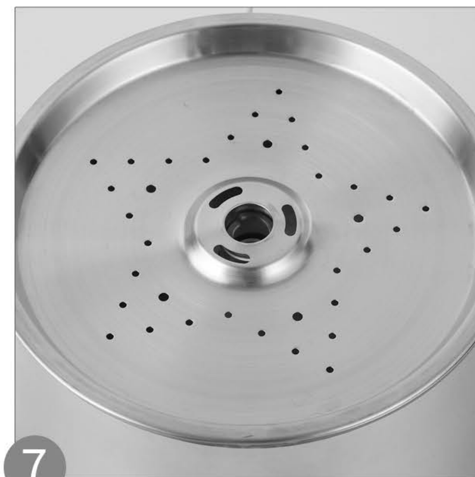
7 Put on the water tray