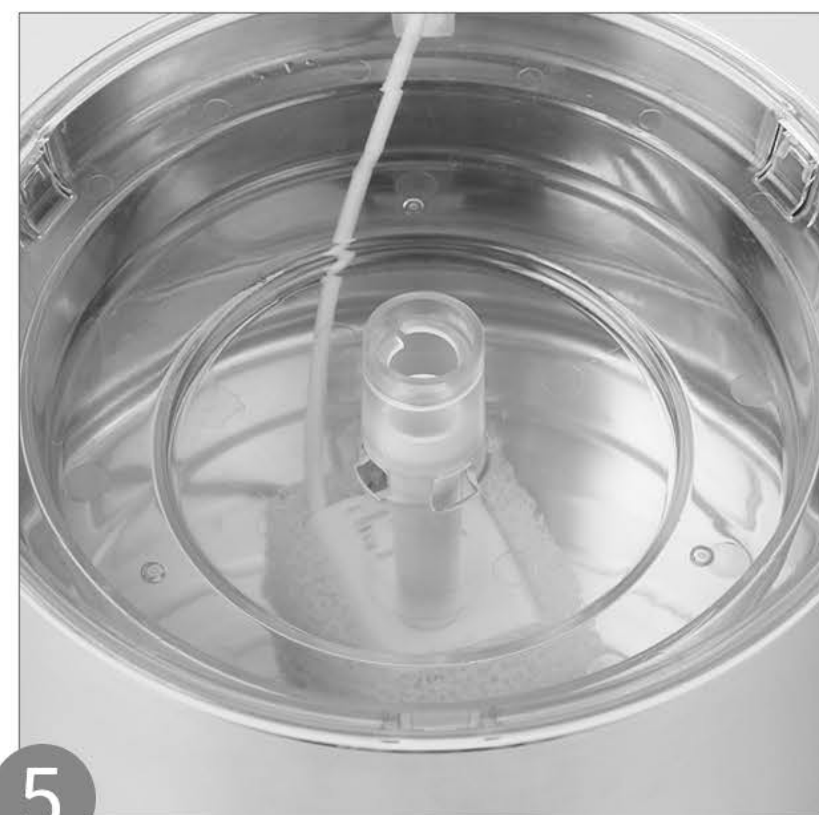
5 Align the nozzle in the middle of the filter shield