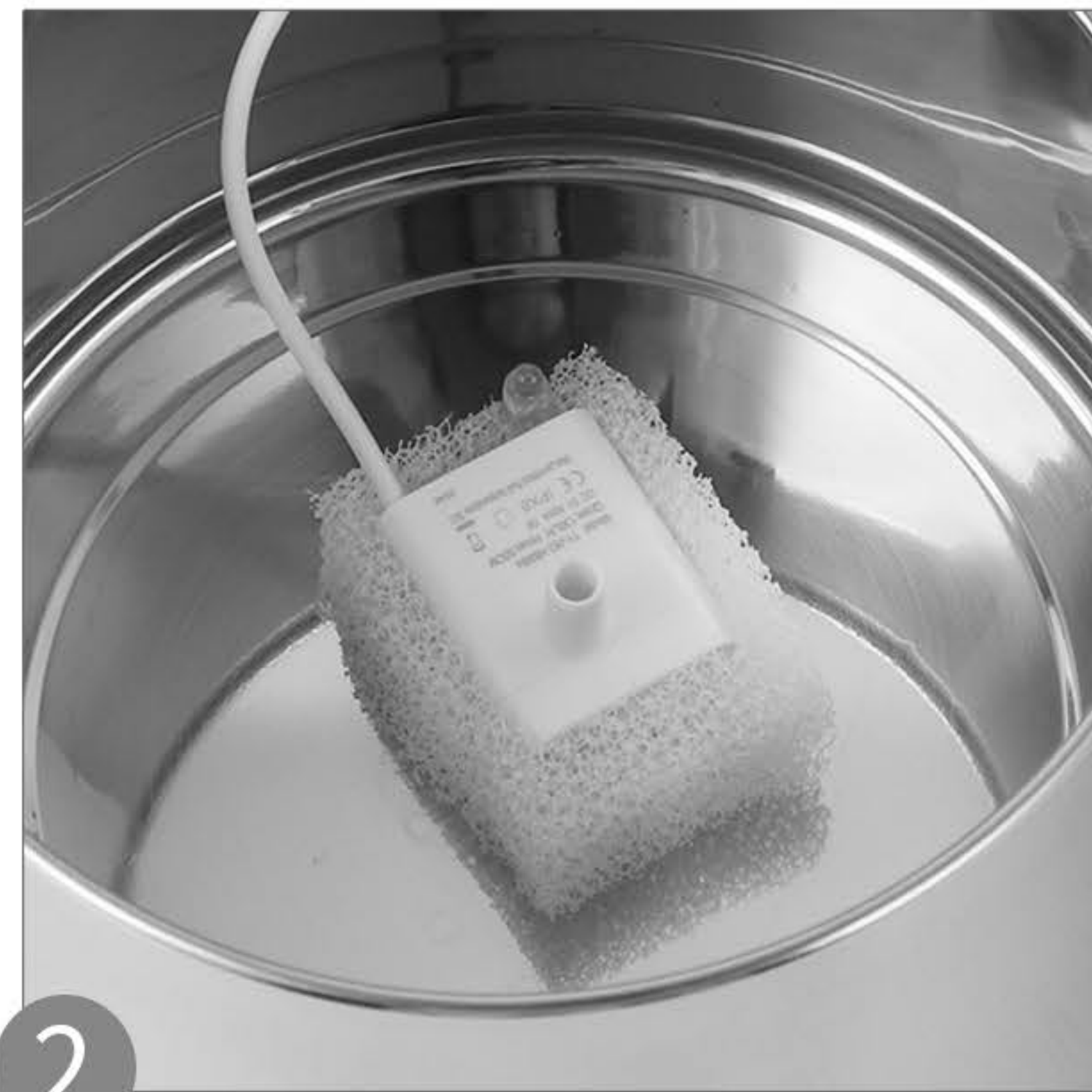
2 Install the water pump in the groove of the water tank